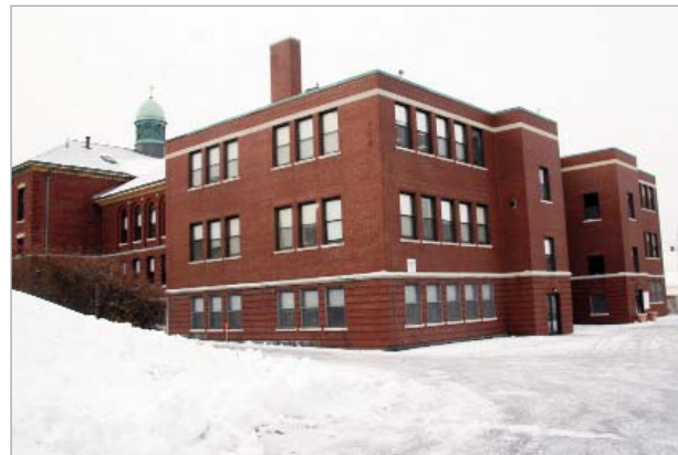
The partnership with Boston College allows St. Columbkille to preserve Catholic education in the Allston-Brighton section of Boston.

Boston College's vision for transforming St. Columbkille goes far beyond saving one school. It's making the school a pilot project for a new model of sustainability for urban Catholic schools. It's the