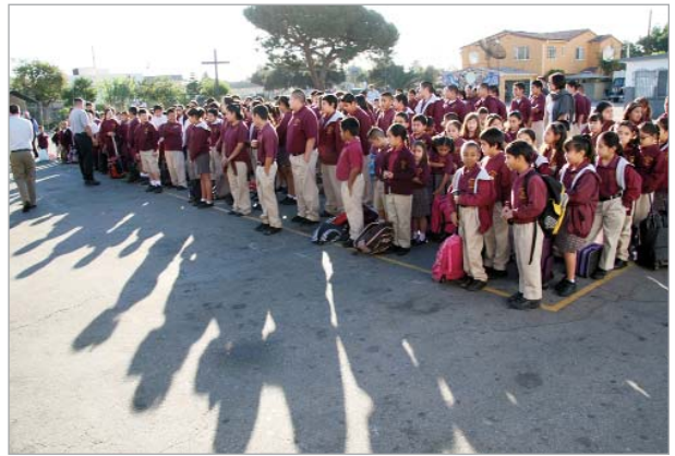
Students at St. Malachy Catholic School gather for morning prayer in an asphalt courtyard, a rare safe haven amid the violence of South Central Los Angeles.